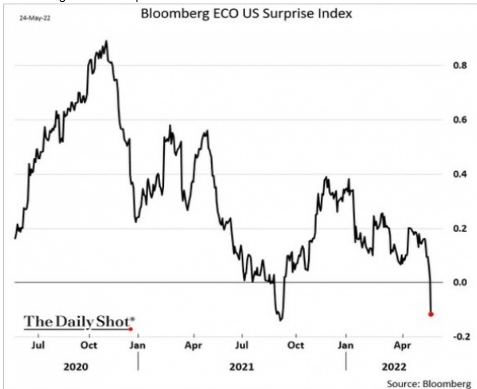
Bloomberg ECO US Surprise Index

Another factor that led to positive performance in the equity and bond markets last week was the fact that recently released macroeconomic figures were below investors' expectations. The US economic surprise indicators point to a sharp slowdown in US growth. These bad figures suggest a lower than expected number of rate hikes, which delights the markets. Bad news becomes good news in a way.